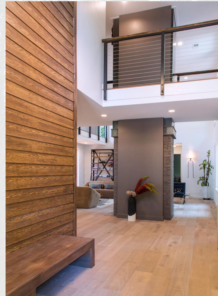
2019 Entry: Brush Hill Residence in Milton MA by KNK Studios